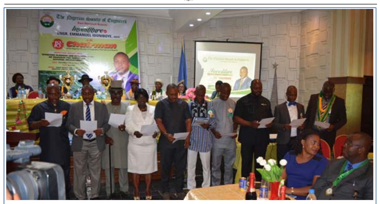
2016 Executive Committee of the Nigerian Society of Engineers taking their oath of office shortly after the Chairman's investiture.