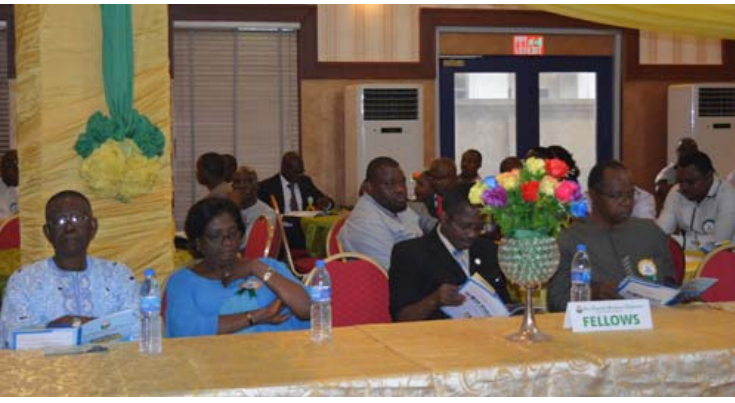
Some Fellows and Elders of the Branch